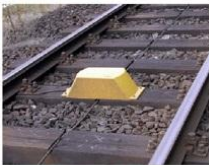
GFC Railway Sleepers (Austria)